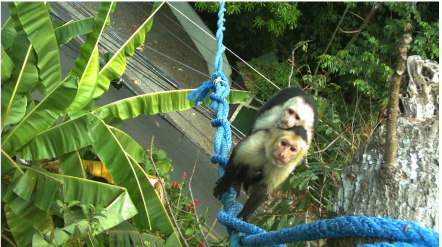
Image 1. Capuchin monkeys cross a "monkey bridge" above a road in Manuel Antonio, Costa Rica. Many different kinds of wildlife crossings, including bridges, tunnels and overpasses, help keep wildlife from getting hit by cars.

Roadkill is a serious problem. In the United States, wildlife causes more than one million automobile accidents every year. They cost $8 billion. That includes money spent on medical care and fixing the vehicles. More than a million animals are killed every day by cars. For many species, it is the main cause of death.