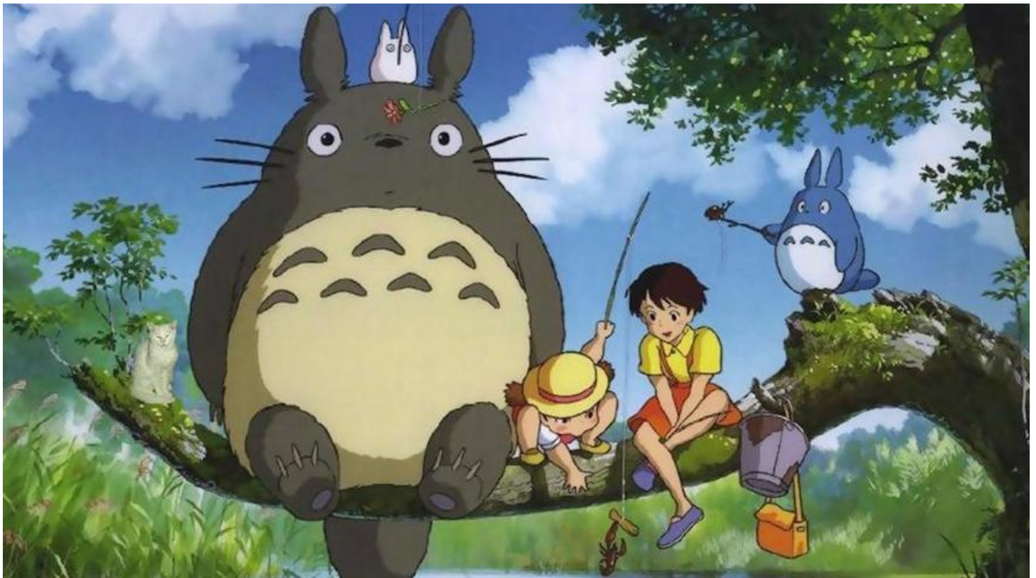
Image 1. A scene from the Studio Ghibli film "My Neighbor Totoro." The character Totoro is on the far left. Illustration: Amal FM/Flickr. Licensed under CC BY 2.0

Some people are trying new things as they are stuck at home because of the coronavirus. It might be a good opportunity to watch some of Japan's animated films.